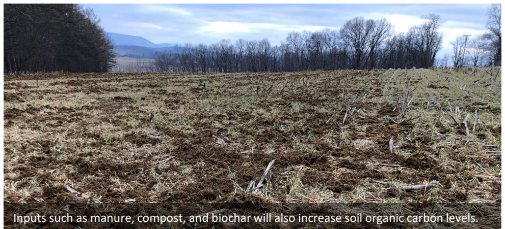
Inputs such as manure, compost, and biochar will also increase soil organic carbon levels.